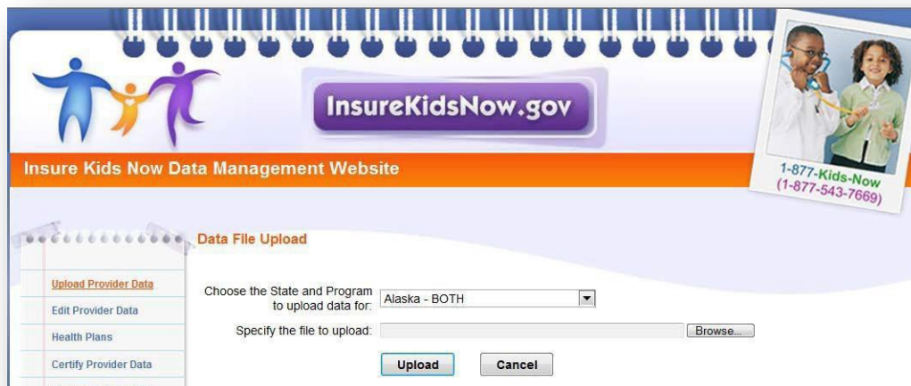
Figure 11: Upload Provider Data Feature

Users can upload their Provider Data Files to the IKN Data Management website. To do so, they select the 'Upload Provider Data' menu option from the left-hand menu on the IKN Data Management website home page. The Upload Provider Data feature is pictured in Figure 11. The user must then select the state and Program Type (i.e., CHIP, Medicaid, or Both) for which they are uploading and specify the file to be uploaded. Once the file has been specified, they may use the 'Upload' button to upload their data. If the user does not want to complete the upload, then the user may select the 'Cancel' button.